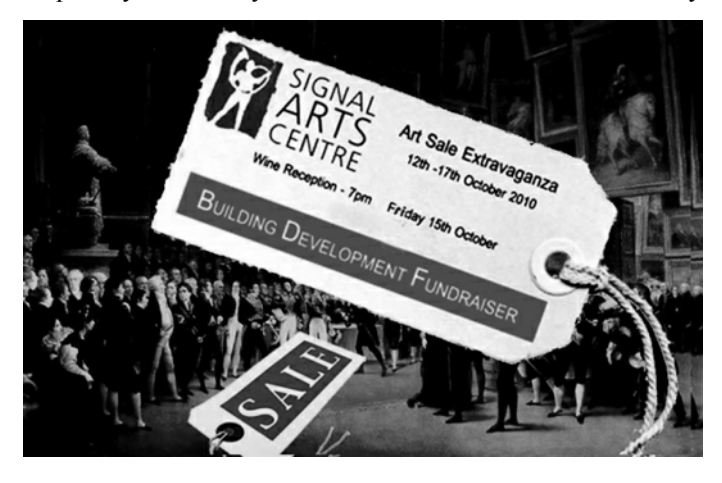
Council. The staff of Signal has also been working tirelessly to

As you know Signal is on the road to fulfilling her long held ambitions and dreams. Part of that dream has been to buy and re-develop the site on which the Centre is currently housed. We began our fundraising efforts in earnest this year and have been helped by both Bray Town Council and Wicklow County